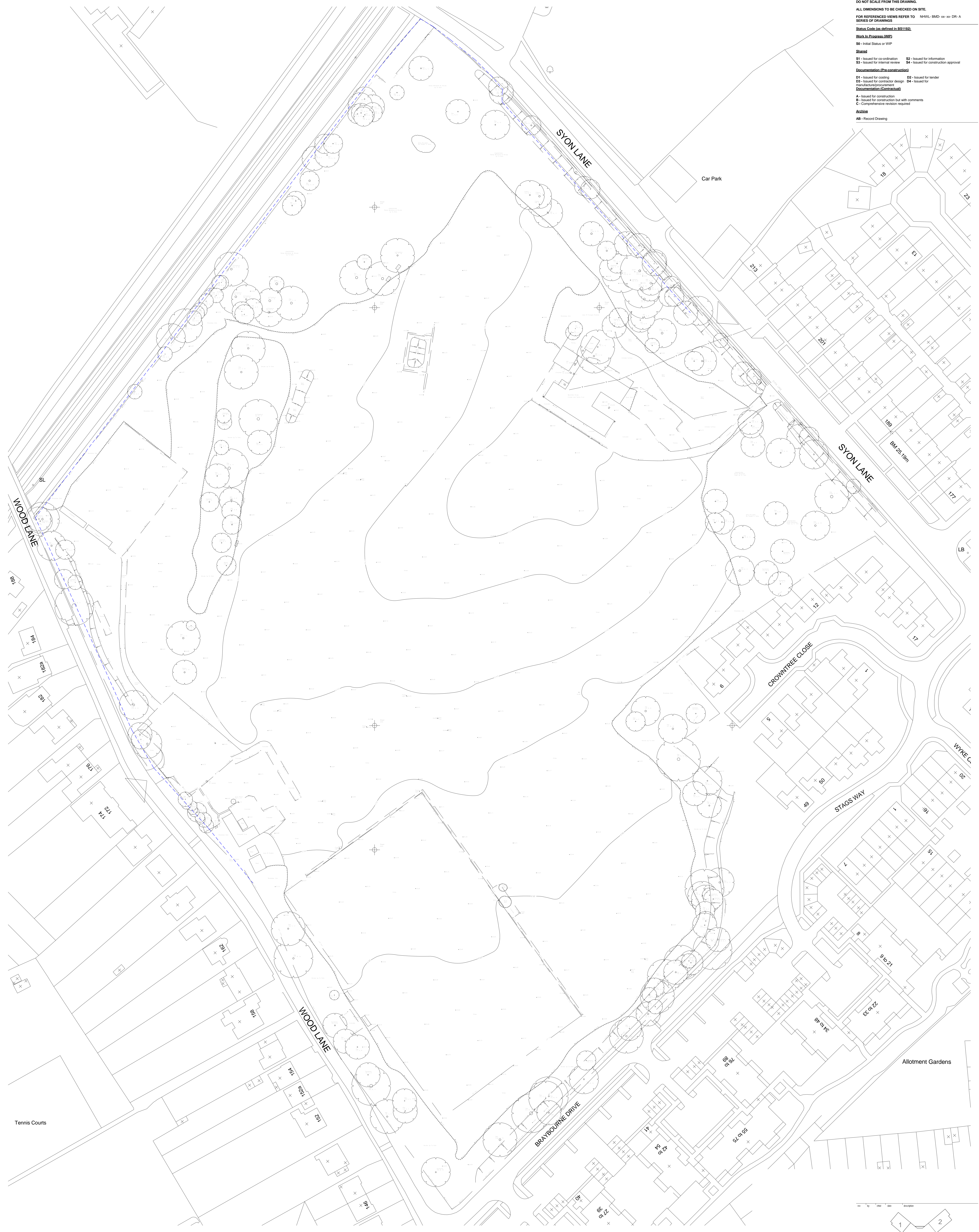
1 Existing Site Layout 1 : 500

DO NOT SCALE FROM THIS DRAWING. ALL DIMENSIONS TO BE CHECKED ON SITE. FOR REFERENCED VIEWS REFER TO NHWL-BMD-xx-xx-DR-A SERIES OF DRAWINGS. Status Code (as defined in BS1192): Work in Progress (WIP) 50 - Initial Status of WIP Shared S1 - Issued for coordination S2 - Issued for information S3 - Issued for external review S4 - Issued for construction approval Documentation (Pre-construction) D1 - Issued for costing D2 - Issued for tender D3 - Issued for contractor design D4 - Issued for manufacturing/procurement Documentation (Contractual) A - Issued for construction B - Issued for construction but with comments C - Comprehensive revision required Action AB - Record Drawing