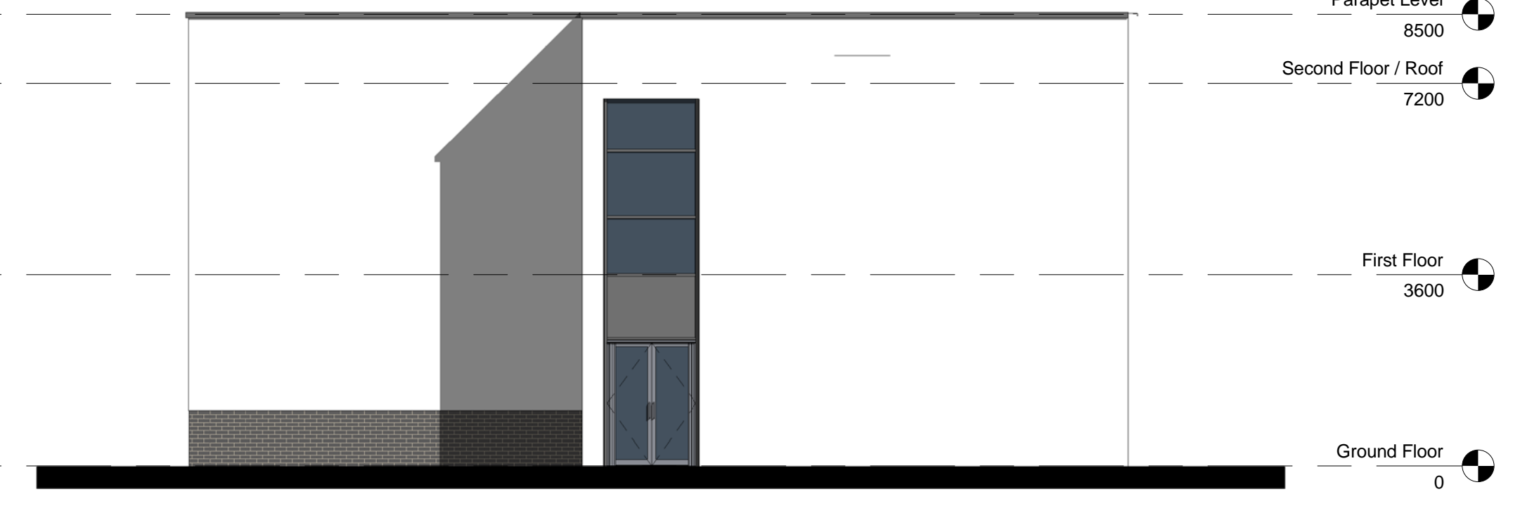
2 Elevation 4 - a 1 : 100