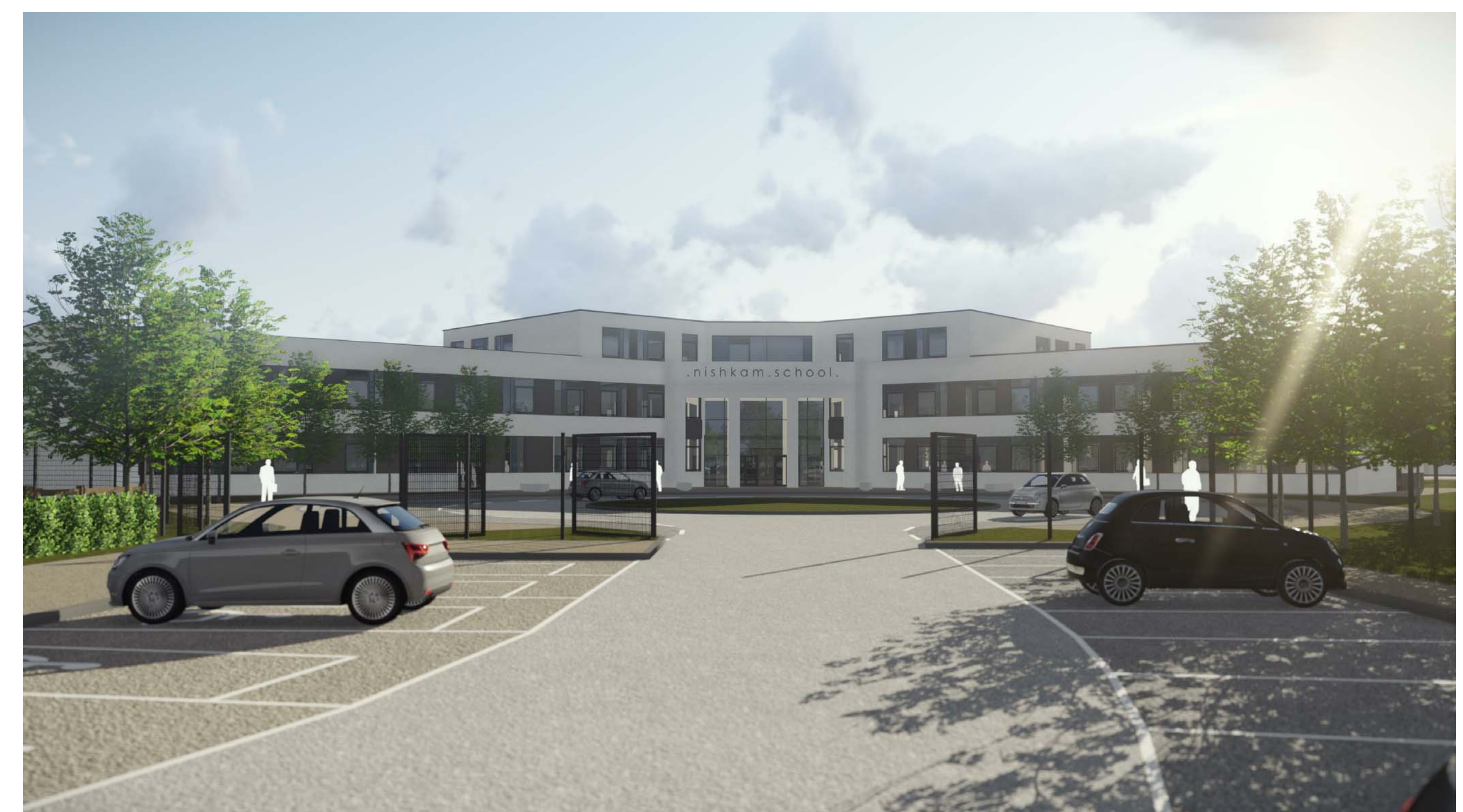
Views showing Approach to Entrance

Status Code (as defined in BS1192) S0 - Initial Status or WIP Shared S1 - Issued for co-ordination S2 - Issued for information S3 - Issued for internal review S4 - Issued for construction approval Documentation (Pre-construction) D1 - Issued for costing D2 - Issued for tender D3 - Issued for contractor design D4 - Issued for manufacture/procurement Documentation (Contractual) A - Issued for construction B - Issued for construction but with comments C - Comprehensive revision required Archive AB - Record Drawing