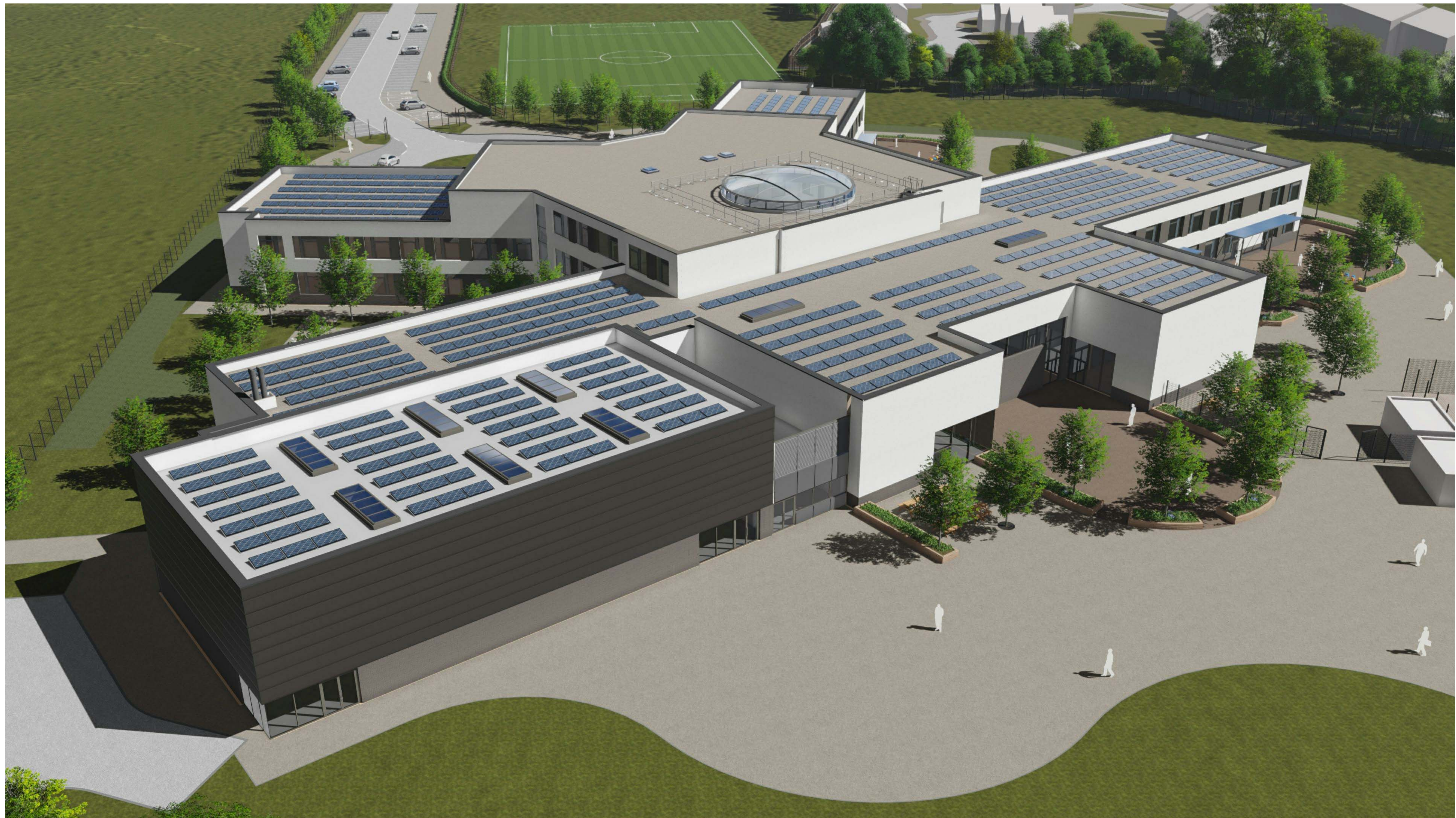
Aerial View from South West

Status Code (as defined in BS1192) D3 - Issued for contractor design D4 - Issued for manufacture/procurement Work In Progress (WIP) S0 - Initial Status or WIP Shared S1 - Issued for co-ordination S2 - Issued for information S3 - Issued for internal review S4 - Issued for construction approval Documentation (Pre-construction) D1 - Issued for costing D2 - Issued for tender Documentation (Contractual) A - Issued for construction B - Issued for construction but with comments C - Comprehensive revision required Archive AB - Record Drawing