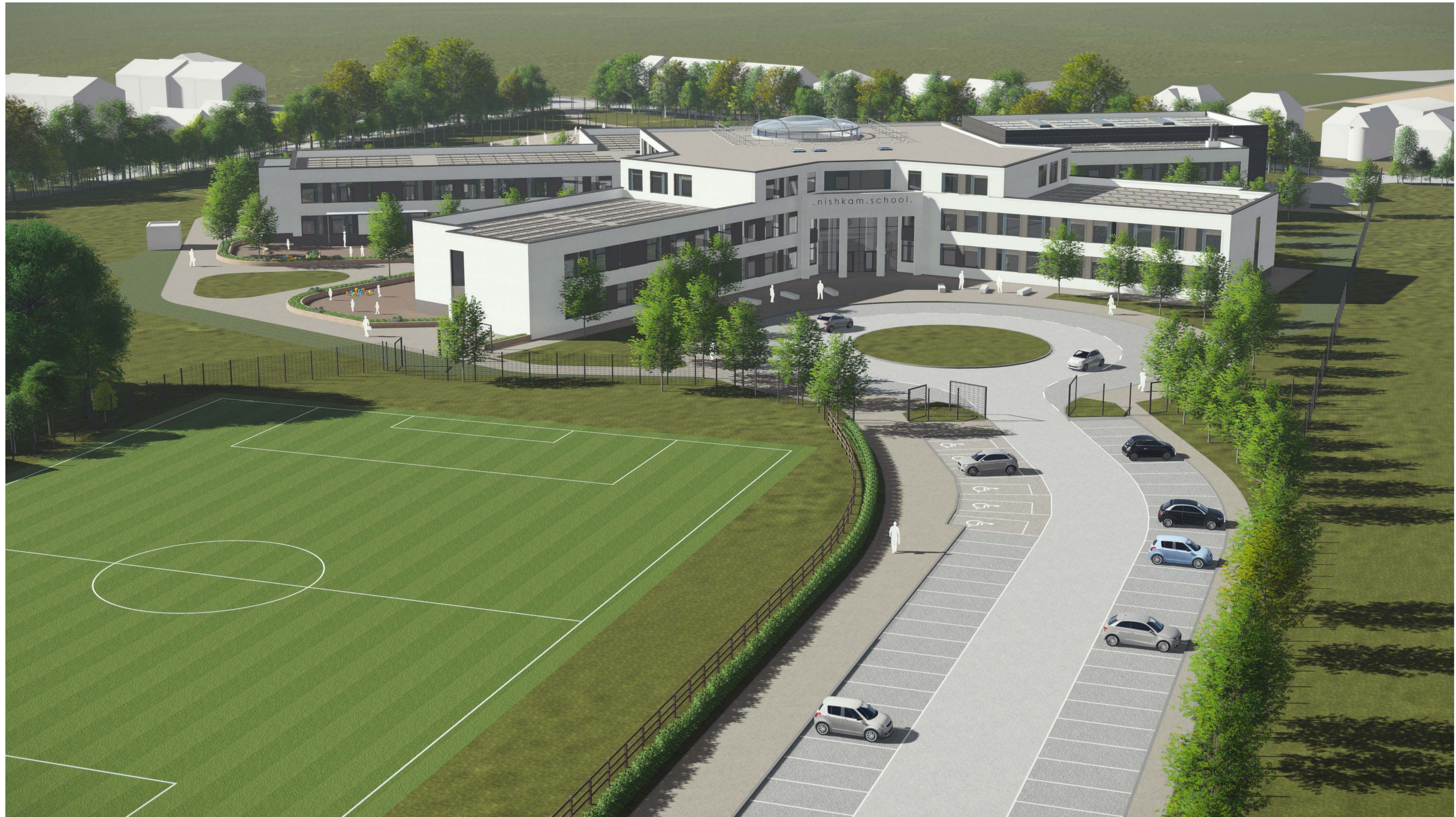
Aerial View of Approach

Status Code (as defined in BS1192) S0 - Initial Status or WIP Shared S1 - Issued for co-ordination S2 - Issued for information S3 - Issued for internal review S4 - Issued for construction approval Documentation (Pre-construction) D1 - Issued for costing D2 - Issued for tender D3 - Issued for contractor design D4 - Issued for manufacture/procurement Documentation (Contractual) A - Issued for construction B - Issued for construction but with comments C - Comprehensive revision required Archive AB - Record Drawing