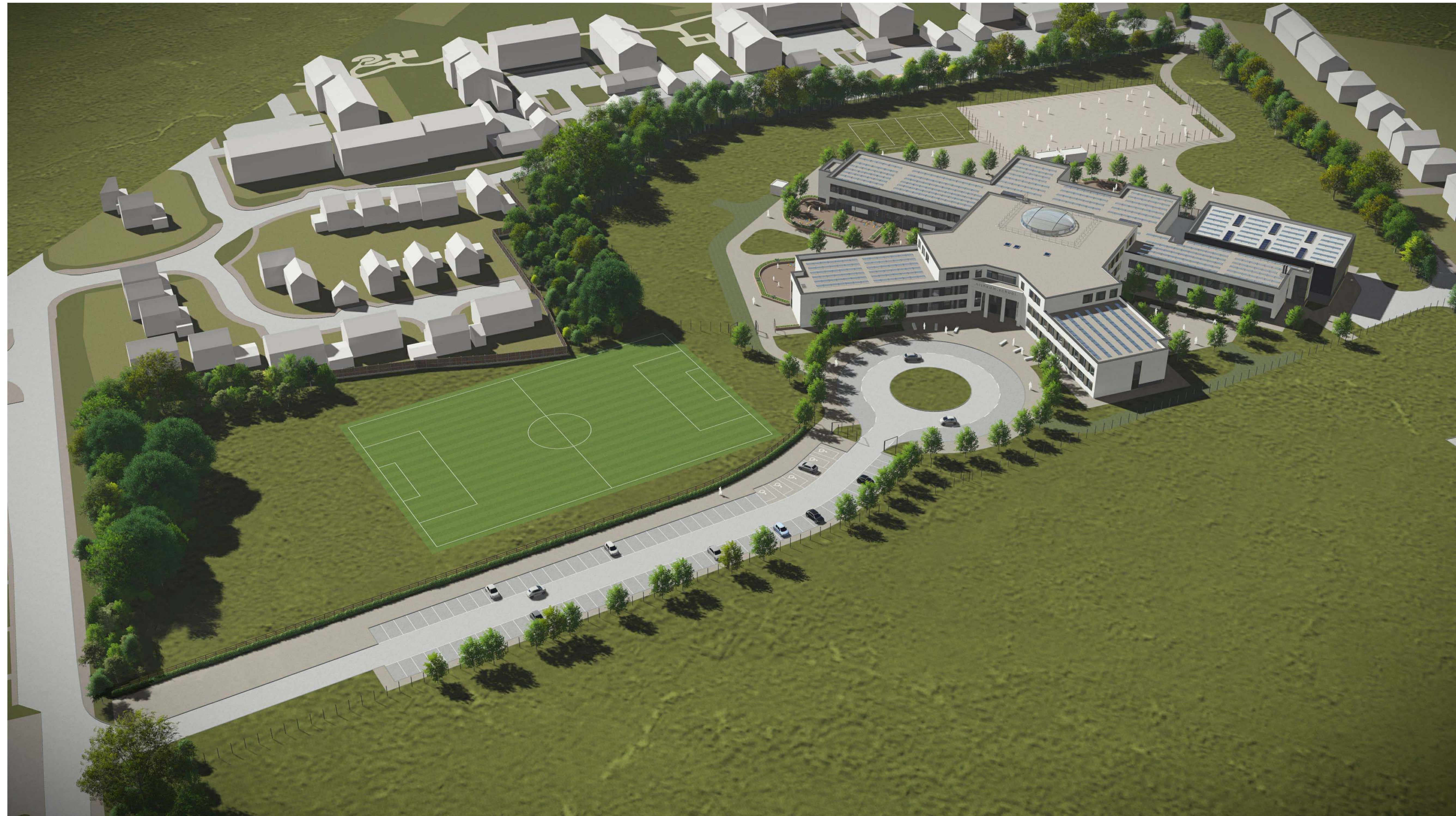
Aerial View from North

Status Code (as defined in BS1192) S0 - Initial Status or WIP Shared S1 - Issued for co-ordination S2 - Issued for information S3 - Issued for internal review S4 - Issued for construction approval Documentation (Pre-construction) D1 - Issued for costing D2 - Issued for tender D3 - Issued for contractor design D4 - Issued for manufacture/procurement Documentation (Contractual) A - Issued for construction B - Issued for construction but with comments C - Comprehensive revision required Archive AB - Record Drawing