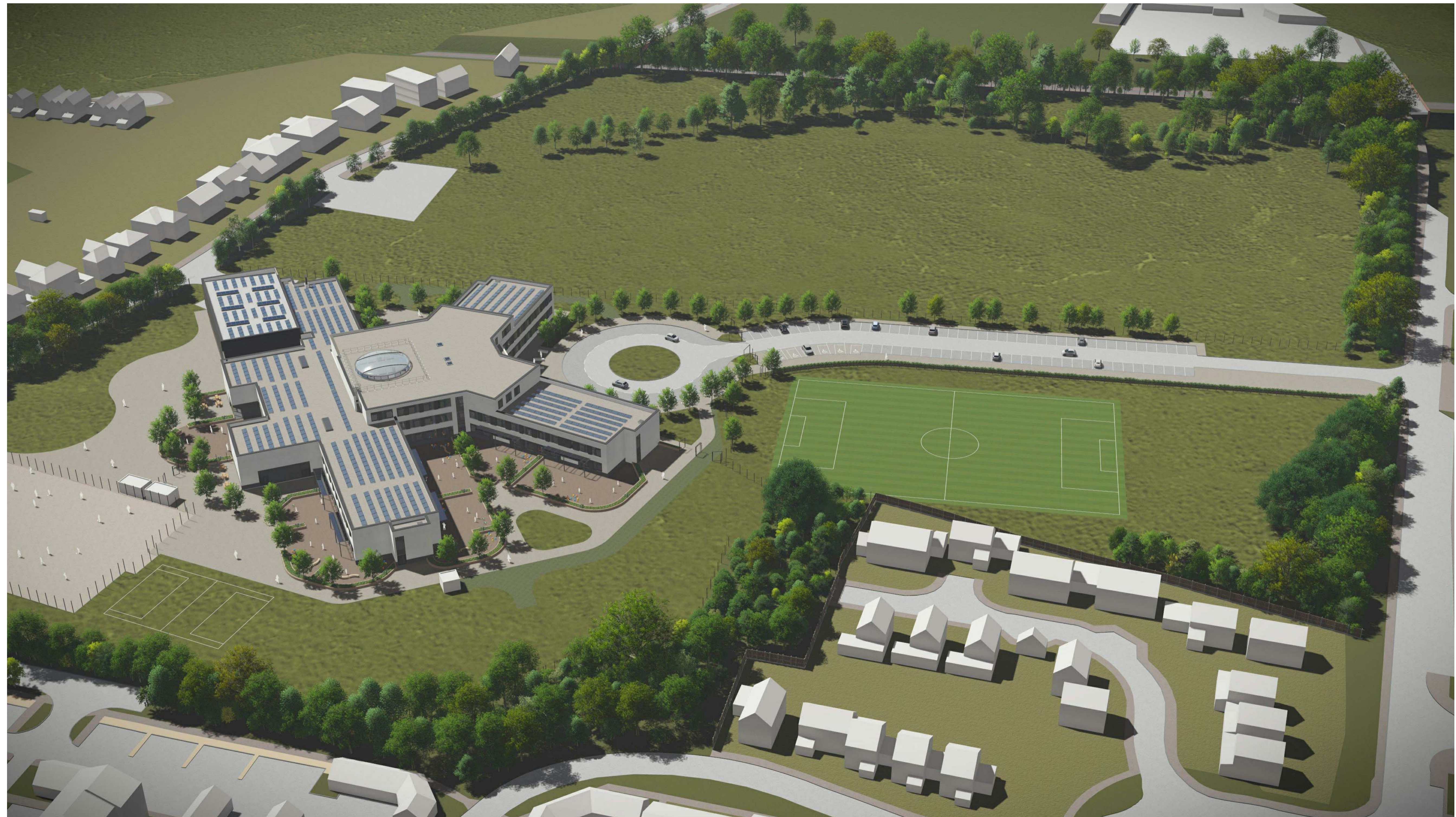
Aerial View from South East

Status Code (as defined in BS1192) S0 - Initial Status or WIP Shared S1 - Issued for co-ordination S2 - Issued for information S3 - Issued for internal review S4 - Issued for construction approval Documentation (Pre-construction) D1 - Issued for costing D2 - Issued for tender D3 - Issued for contractor design D4 - Issued for manufacture/procurement Documentation (Contractual) A - Issued for construction B - Issued for construction but with comments C - Comprehensive revision required Archive AB - Record Drawing