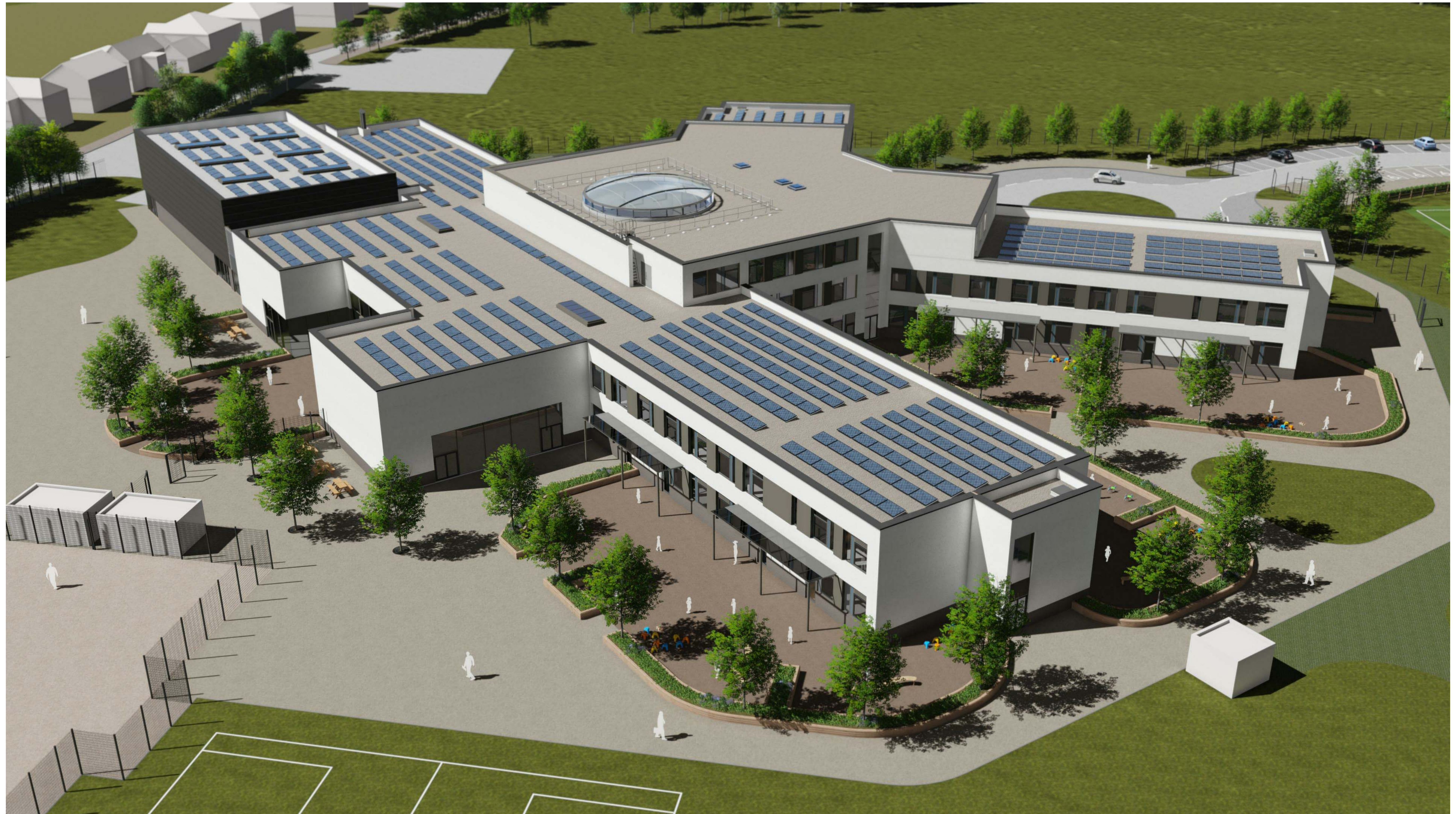
Aerial View of Primary Wings

Status Code (as defined in BS1192) S0 - Initial Status or WIP Shared S1 - Issued for co-ordination S2 - Issued for information S3 - Issued for internal review S4 - Issued for construction approval Documentation (Pre-construction) D1 - Issued for costing D2 - Issued for tender D3 - Issued for contractor design D4 - Issued for manufacture/procurement Documentation (Contractual) A - Issued for construction B - Issued for construction but with comments C - Comprehensive revision required Archive AB - Record Drawing