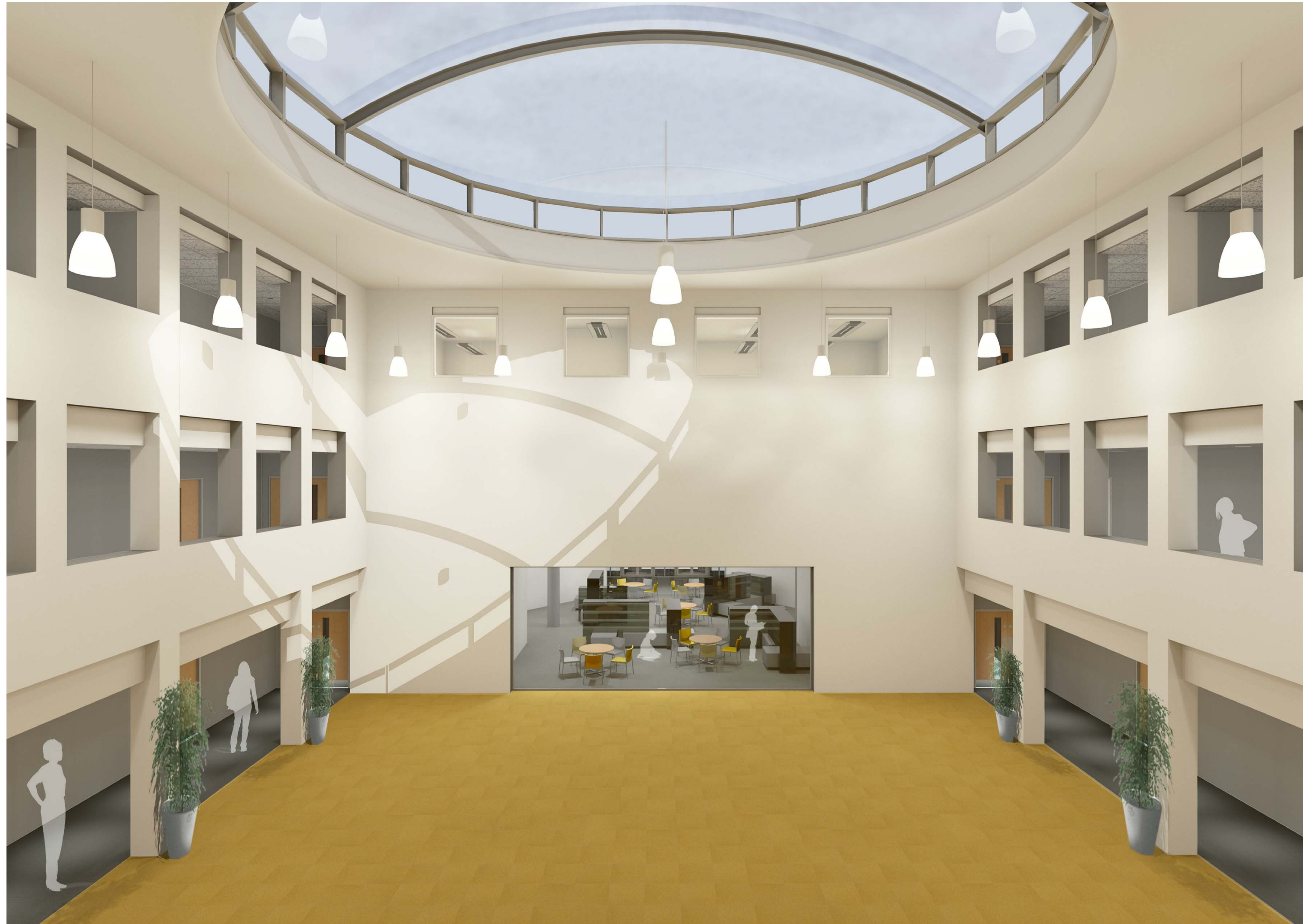
View of Faith Space towards LRC

Status Code (as defined in BS1192) S0 - Initial Status or WIP S1 - Issued for co-ordination S2 - Issued for information S3 - Issued for internal review S4 - Issued for construction approval Documentation (Pre-construction) D1 - Issued for costing D2 - Issued for tender Documentation (Contractual) A - Issued for construction B - Issued for construction but with comments C - Comprehensive revision required Archive AB - Record Drawing D3 - Issued for contractor design D4 - Issued for manufacture/procurement