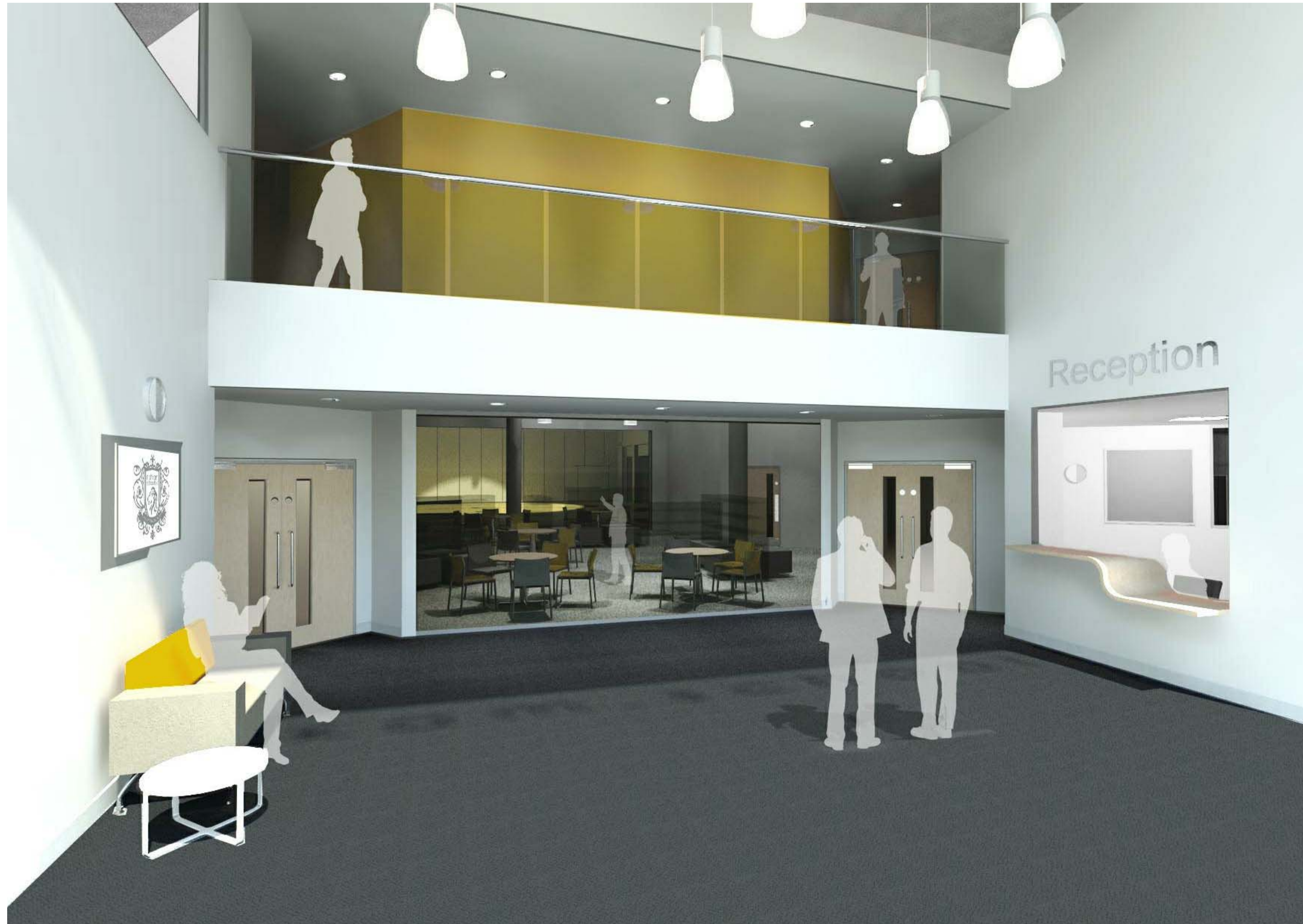
View of Entance Lobby

Status Code (as defined in BS1192) S0 - Initial Status or WIP Shared S1 - Issued for co-ordination S2 - Issued for information S3 - Issued for internal review S4 - Issued for construction approval Documentation (Pre-construction) D1 - Issued for costing D2 - Issued for tender D3 - Issued for contractor design D4 - Issued for manufacture/procurement Documentation (Contractual) A - Issued for construction B - Issued for construction but with comments C - Comprehensive revision required Archive AB - Record Drawing