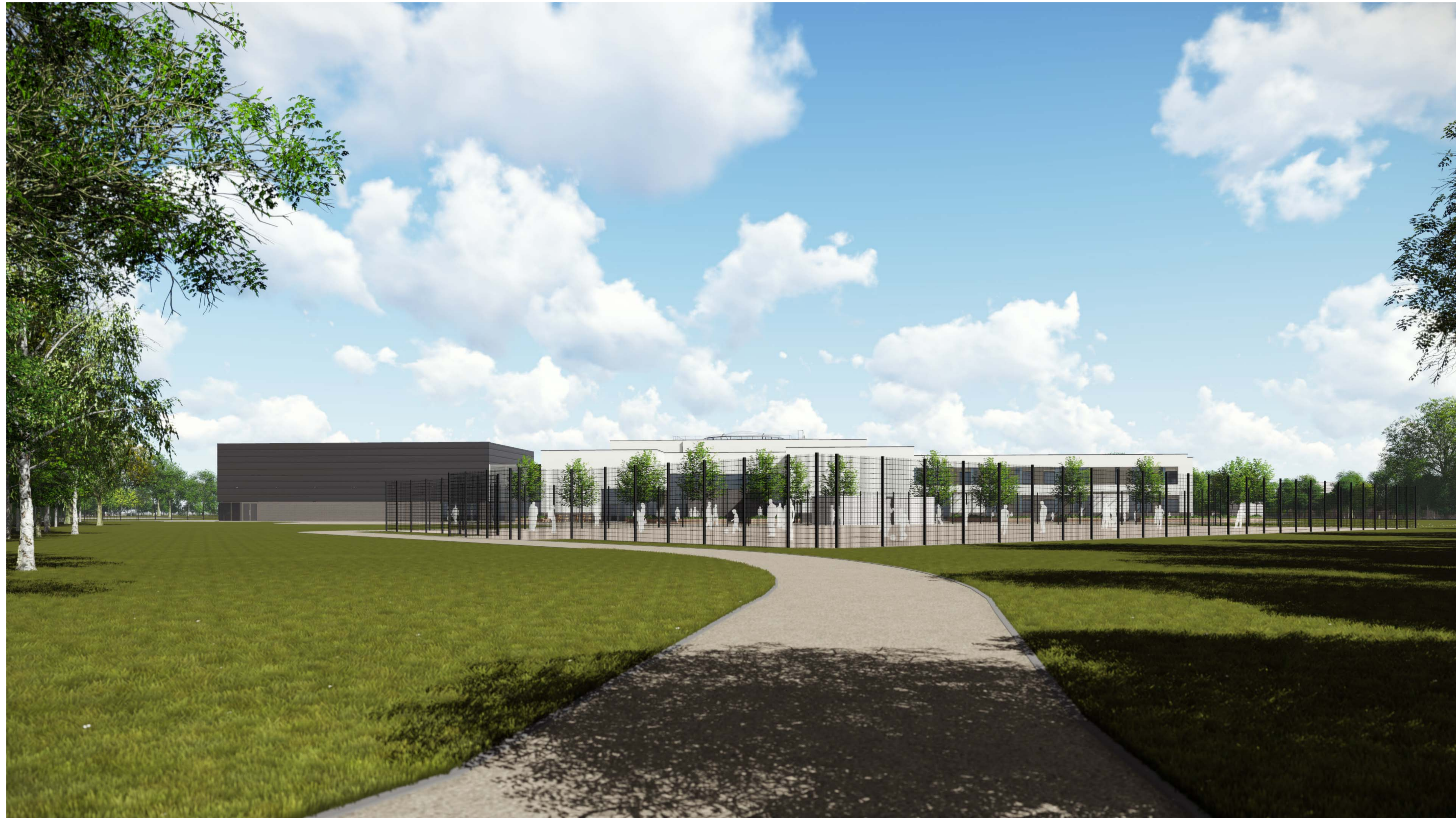
View of Pedestrian Access from Wood Lane

Status Code (as defined in BS1192) S0 - Initial Status or WIP Shared S1 - Issued for co-ordination S2 - Issued for information S3 - Issued for internal review S4 - Issued for construction approval Documentation (Pre-construction) D1 - Issued for costing D2 - Issued for tender D3 - Issued for contractor design D4 - Issued for manufacture/procurement Documentation (Contractual) A - Issued for construction B - Issued for construction but with comments C - Comprehensive revision required Archive AB - Record Drawing