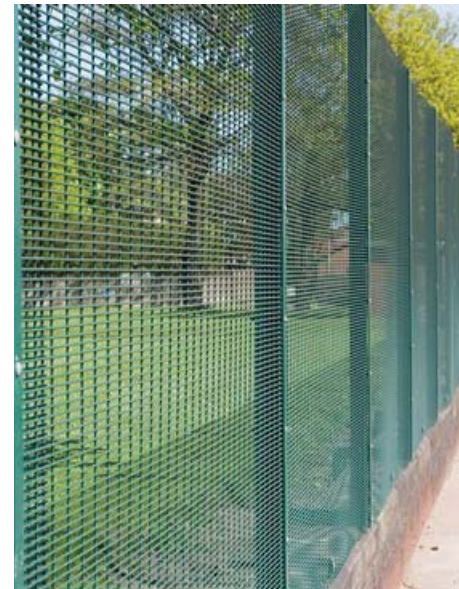
2.4m high weldmesh fencing