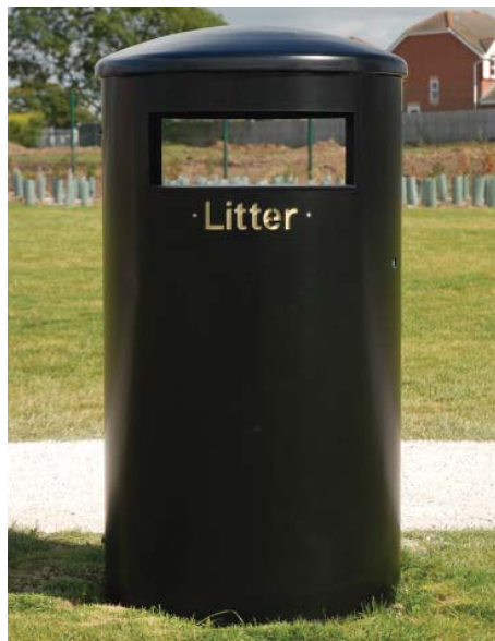
Steel litter bins