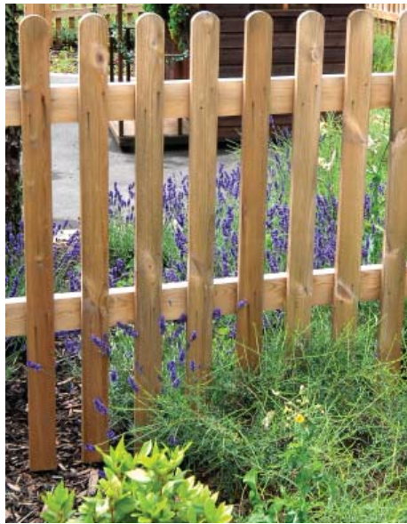
1.2m timber fencing