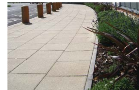
Textured concrete paving setts and slabs