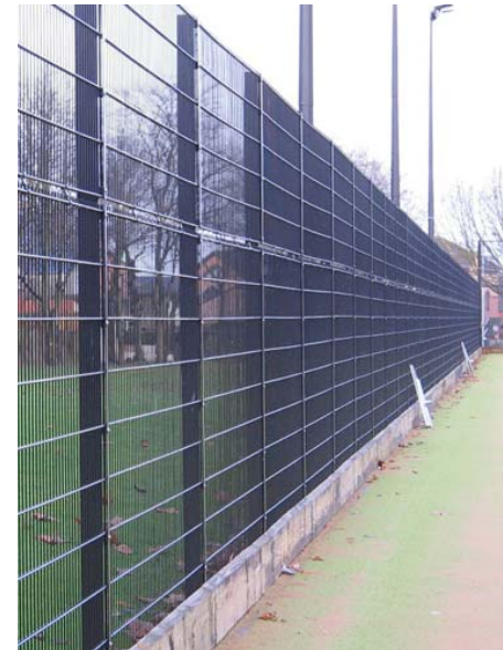
3.0m high sports fencing