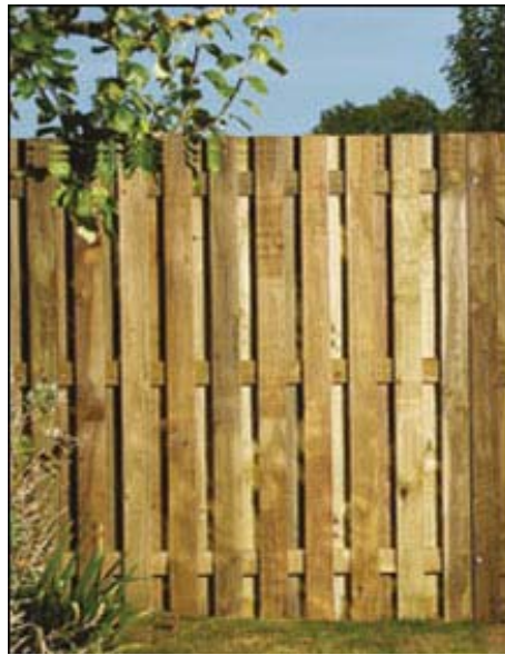
Refuse store 1.8m hit and miss timber fencing