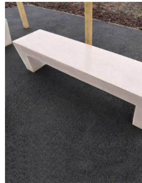
Precast concrete bench