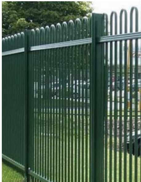
Main site boundary fence by others 2.4m high bow top fencing