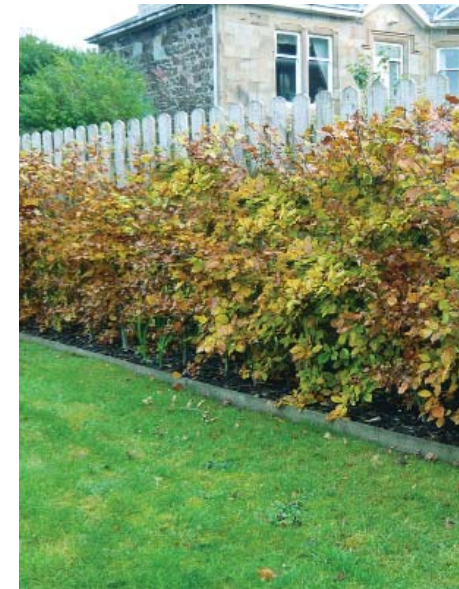
Hedges and 1.2m timber fencing