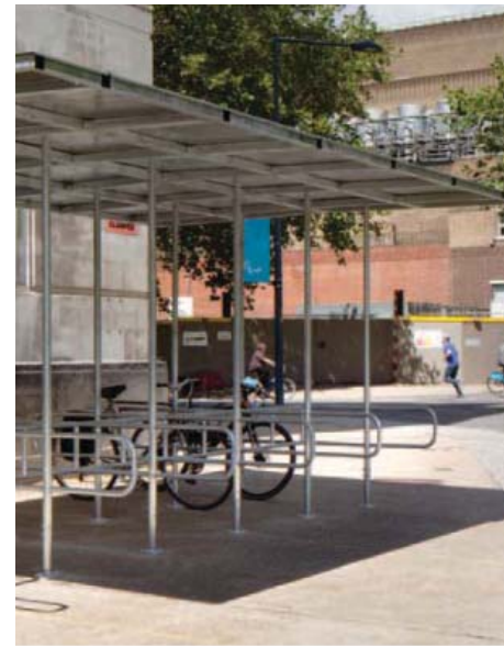
Covered cycle parking