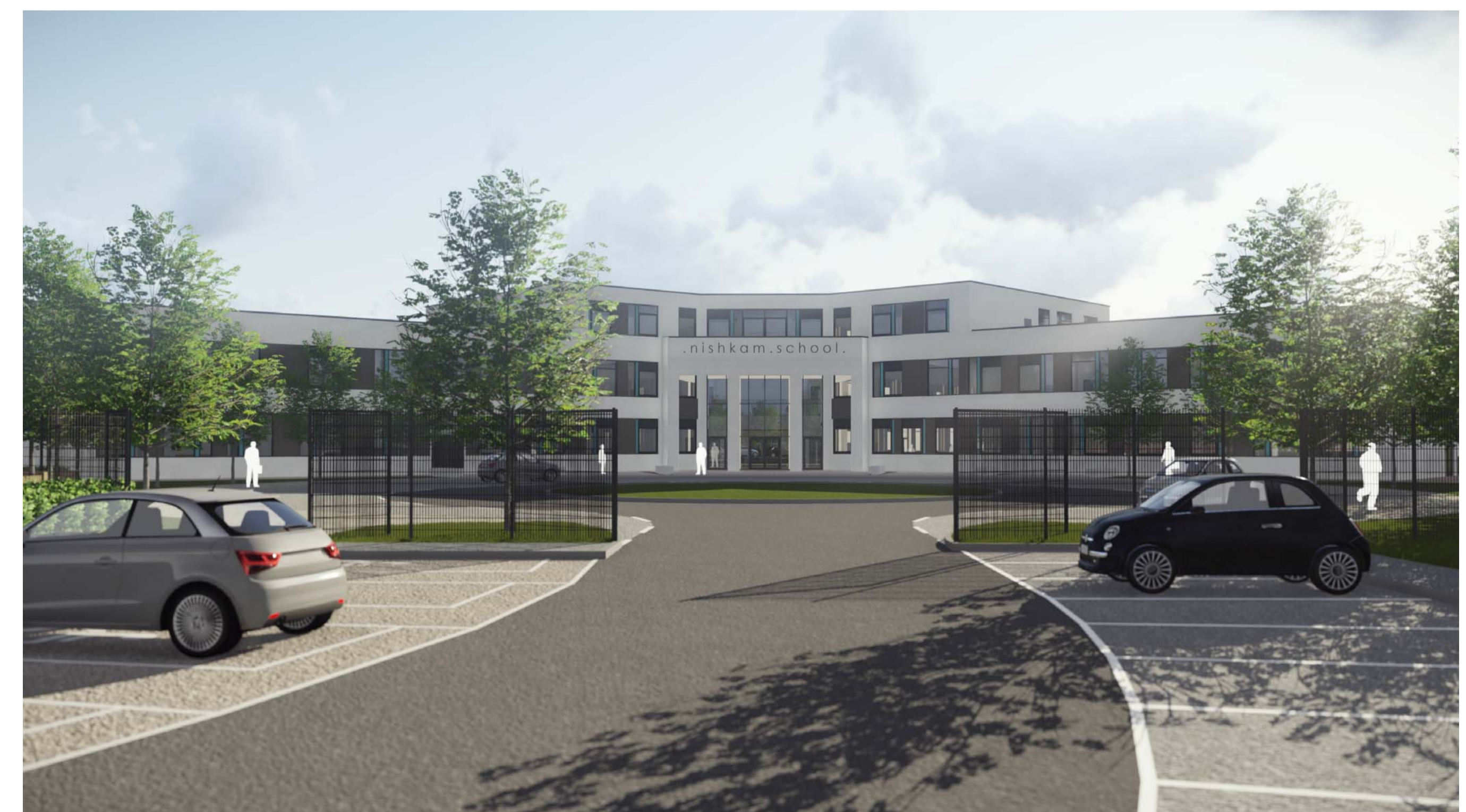
Views showing Approach to Entrance

Status Code (as defined in BS1192) S0 - Initial Status or WIP Shared S1 - Issued for co-ordination S2 - Issued for information S3 - Issued for internal review S4 - Issued for construction approval Documentation (Pre-construction) D1 - Issued for costing D2 - Issued for tender D3 - Issued for contractor design D4 - Issued for manufacture/procurement Documentation (Contractual) A - Issued for construction B - Issued for construction but with comments C - Comprehensive revision required Archive AB - Record Drawing