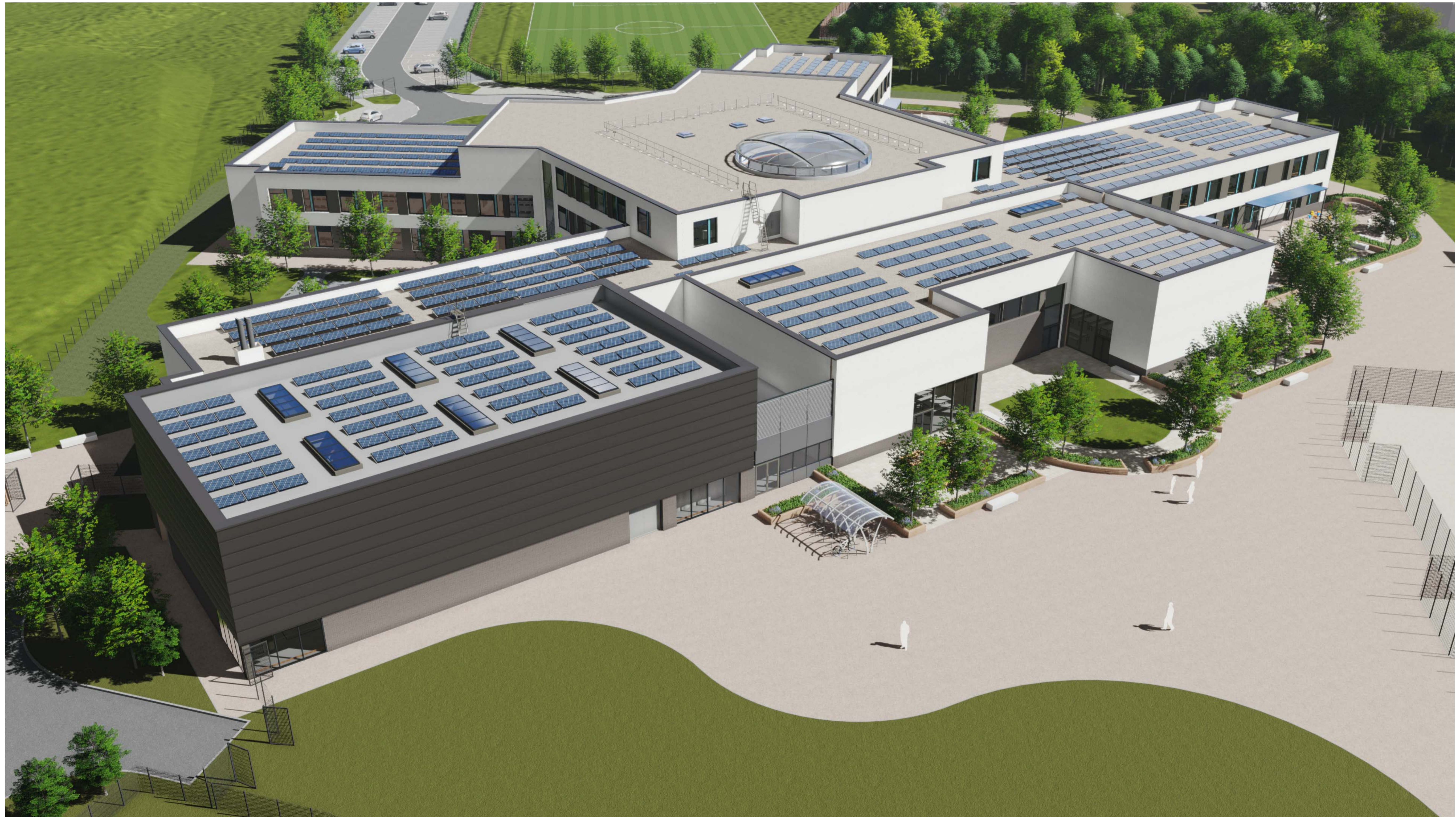
Aerial View from South West

Status Code (as defined in BS1192) S0 - Initial Status or WIP Shared S1 - Issued for co-ordination S2 - Issued for information S3 - Issued for internal review S4 - Issued for construction approval Documentation (Pre-construction) D1 - Issued for costing D2 - Issued for tender D3 - Issued for contractor design D4 - Issued for manufacture/procurement Documentation (Contractual) A - Issued for construction B - Issued for construction but with comments C - Comprehensive revision required Archive AB - Record Drawing