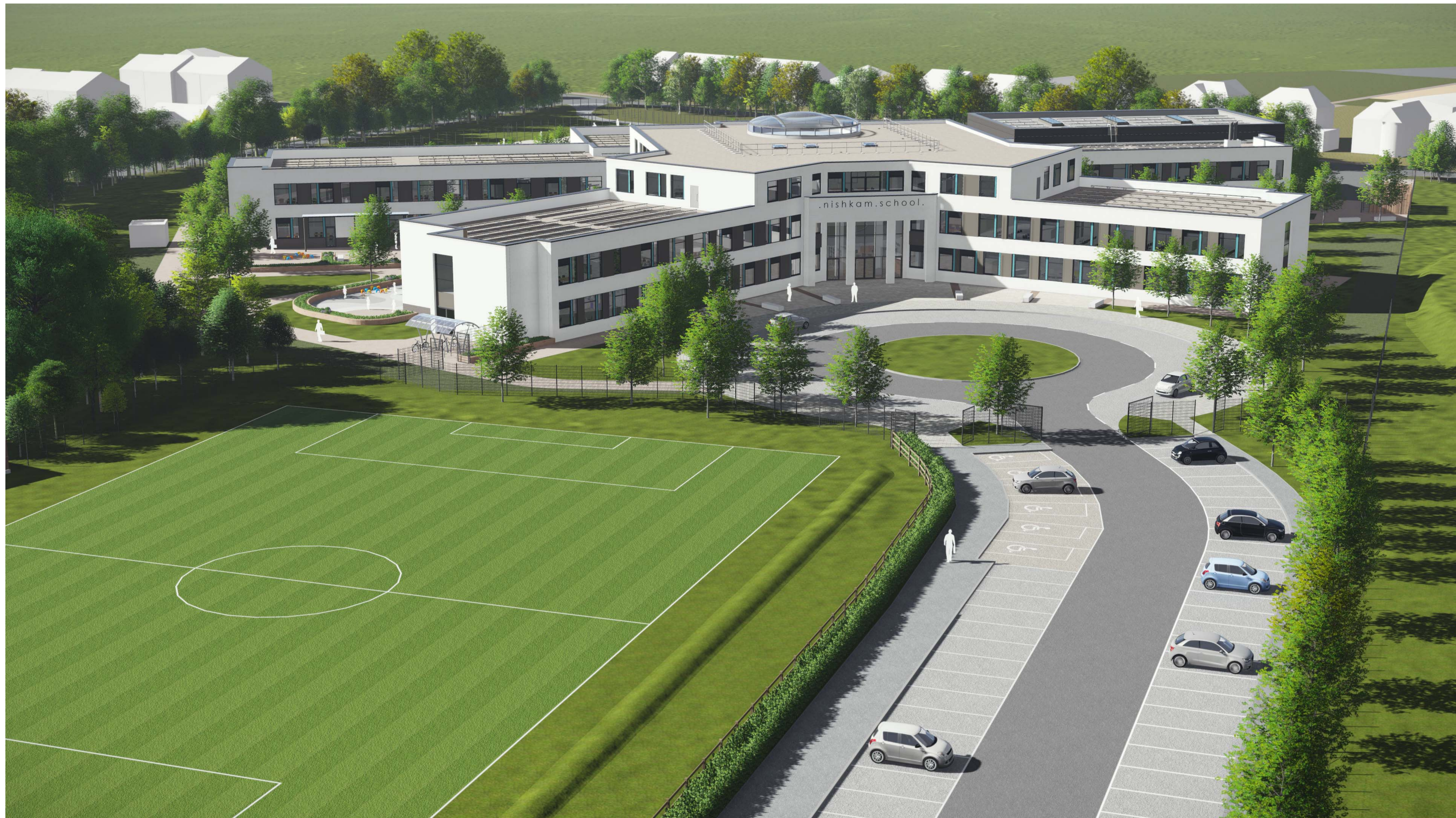
Aerial View of Approach

Status Code (as defined in BS1192) S0 - Initial Status or WIP Shared S1 - Issued for co-ordination S2 - Issued for information S3 - Issued for internal review S4 - Issued for construction approval Documentation (Pre-construction) D1 - Issued for costing D2 - Issued for tender D3 - Issued for contractor design D4 - Issued for manufacture/procurement Documentation (Contractual) A - Issued for construction B - Issued for construction but with comments C - Comprehensive revision required Archive AB - Record Drawing