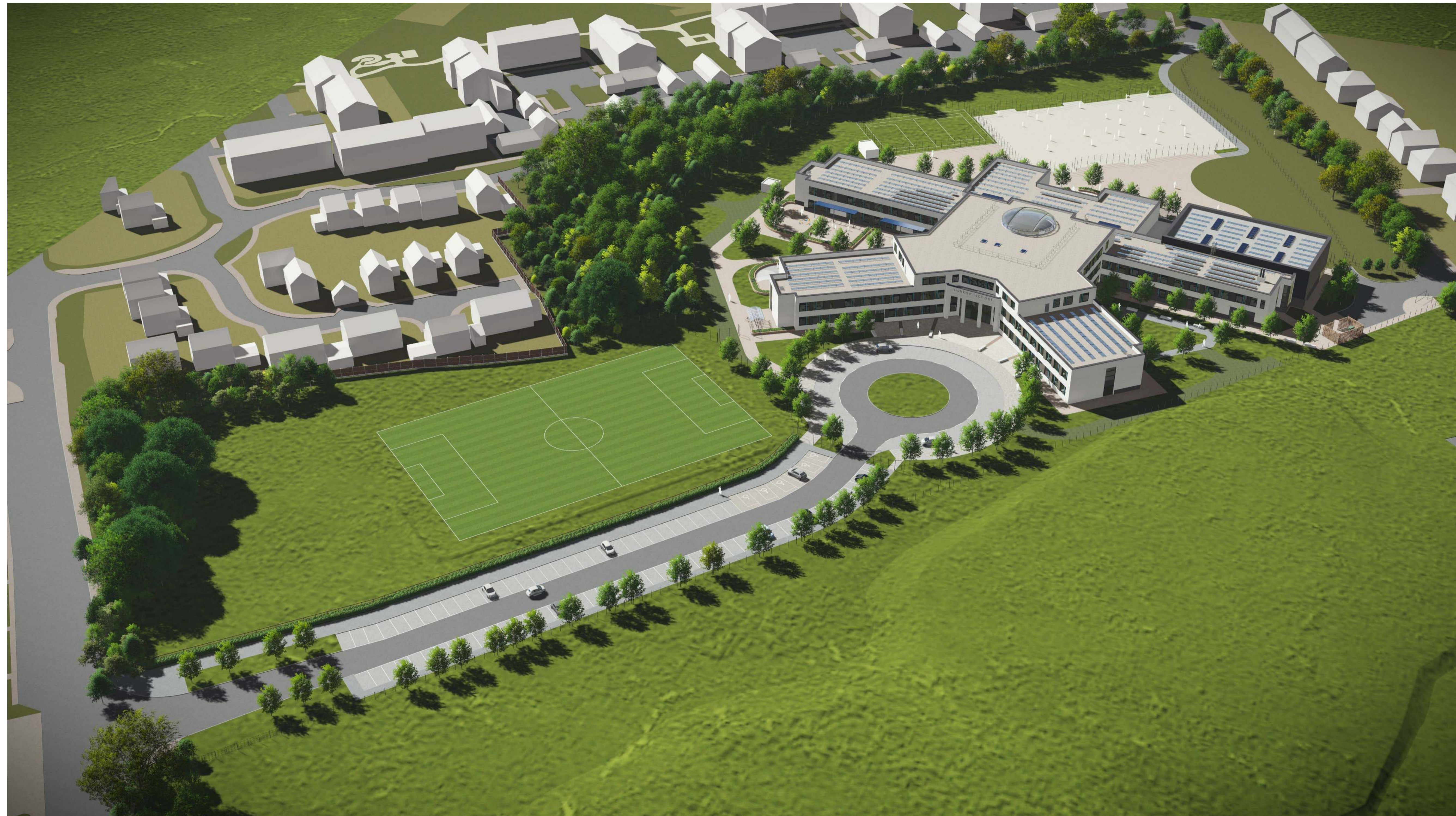
Aerial View from North

Status Code (as defined in BS1192) S0 - Initial Status or WIP Shared S1 - Issued for co-ordination S2 - Issued for information S3 - Issued for internal review S4 - Issued for construction approval Documentation (Pre-construction) D1 - Issued for costing D2 - Issued for tender