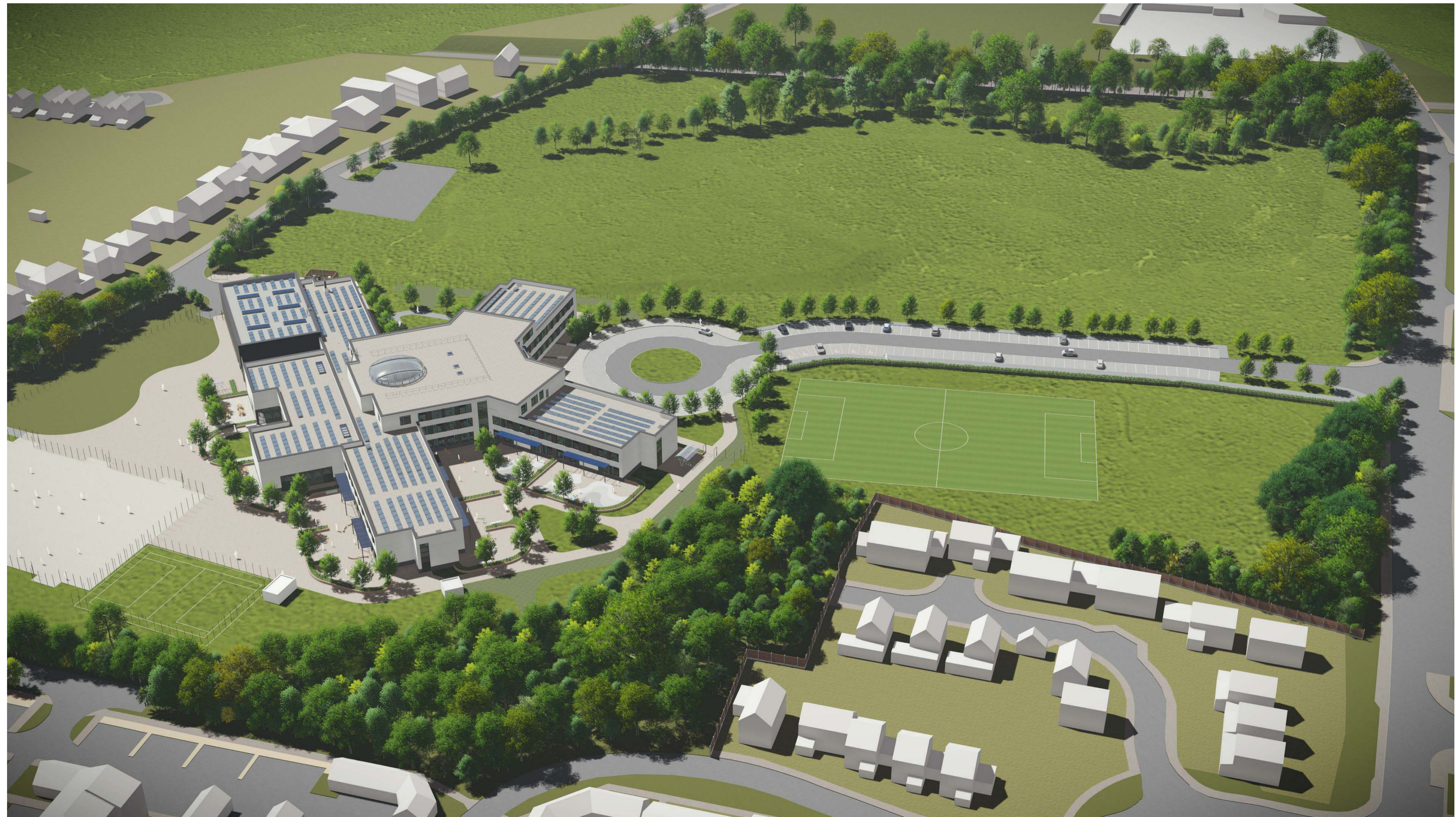
Aerial View from South East

Status Code (as defined in BS1192) S0 - Initial Status or WIP Shared S1 - Issued for co-ordination S2 - Issued for information S3 - Issued for internal review S4 - Issued for construction approval Documentation (Pre-construction) D1 - Issued for costing D2 - Issued for tender D3 - Issued for contractor design D4 - Issued for manufacture/procurement Documentation (Contractual) A - Issued for construction B - Issued for construction but with comments C - Comprehensive revision required Archive AB - Record Drawing