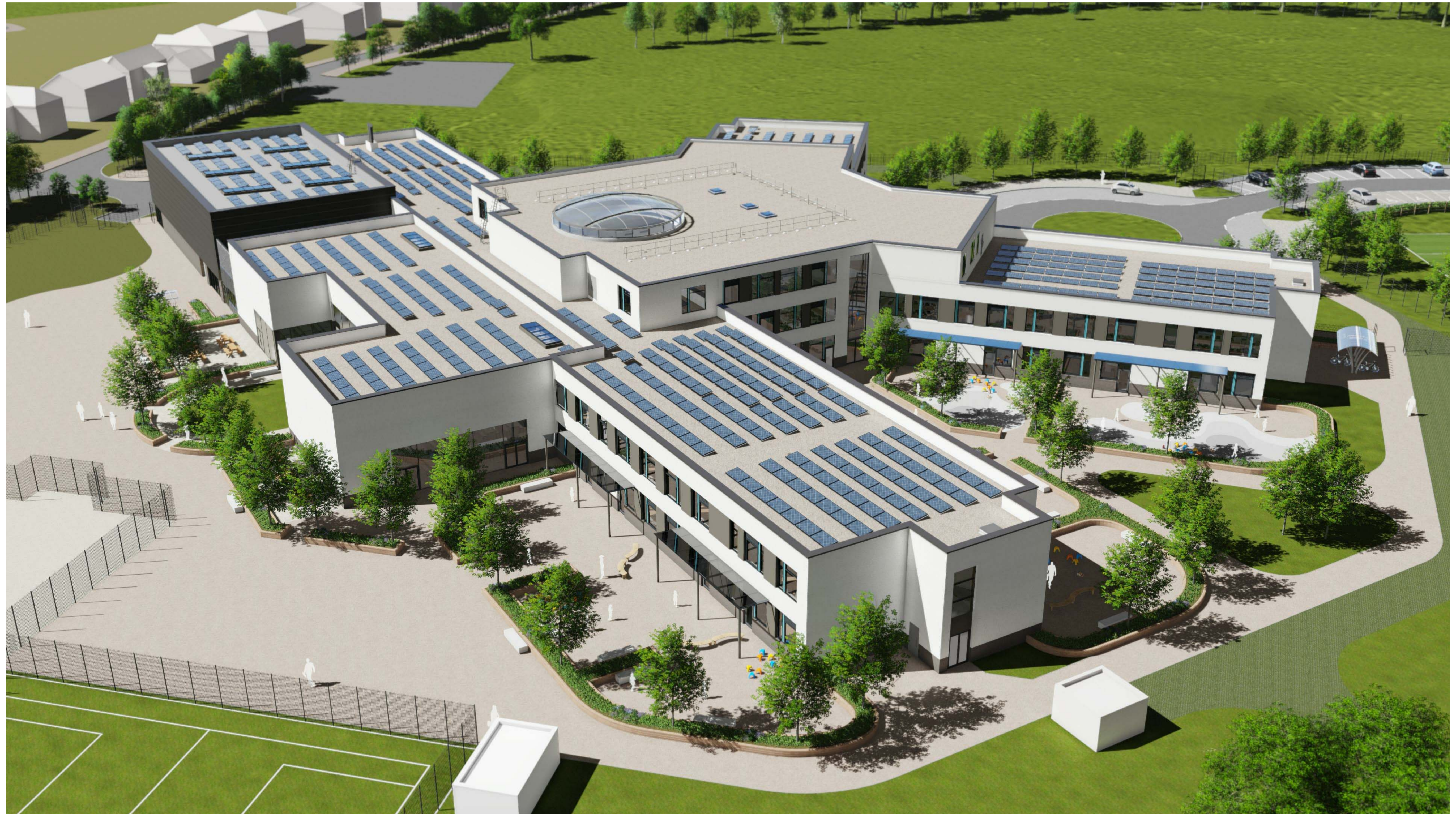
Aerial View of Primary Wings

Status Code (as defined in BS1192) S0 - Initial Status or WIP Shared S1 - Issued for co-ordination S2 - Issued for information S3 - Issued for internal review S4 - Issued for construction approval Documentation (Pre-construction) D1 - Issued for costing D2 - Issued for tender D3 - Issued for contractor design D4 - Issued for manufacture/procurement Documentation (Contractual) A - Issued for construction B - Issued for construction but with comments C - Comprehensive revision required Archive AB - Record Drawing